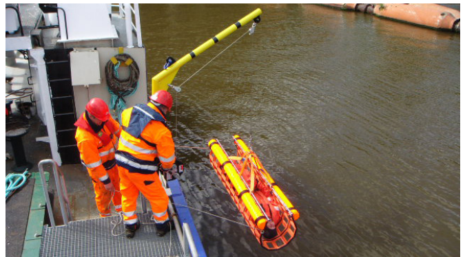
MOB-Davit with Jason's Cradle