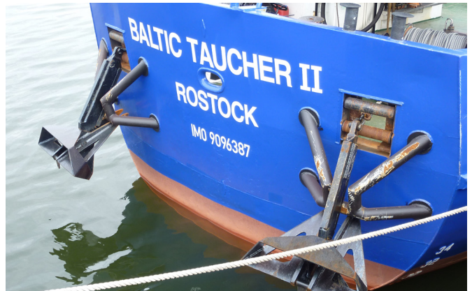
Delta Flipper Anchors for 4-point Mooring