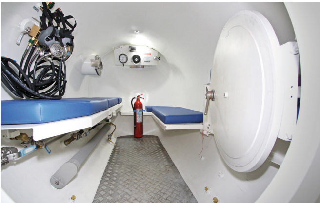
Deck Decompression Chamber