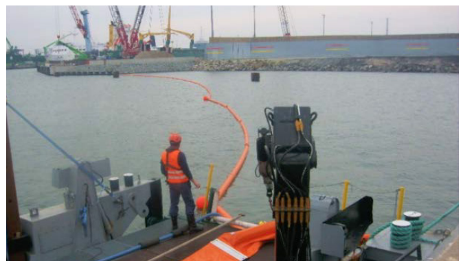
Oil spill response training in port