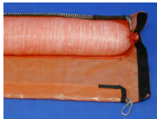
Floating curtain absorber boom