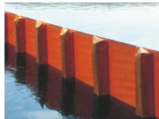
Solid flotation curtain boom