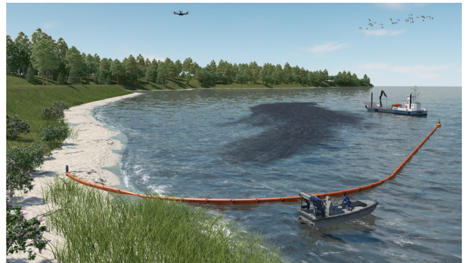
Oil spill response scenario nearshore