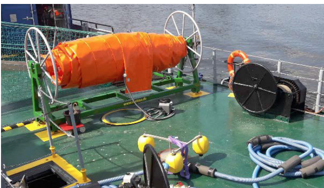
Inflatable containment boom and skimmer on MS FLUNDER