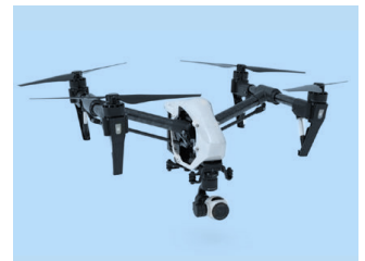
Drone „DPI Inspire 1“