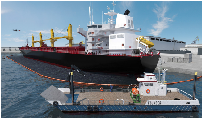
Oil spill response scenario in port